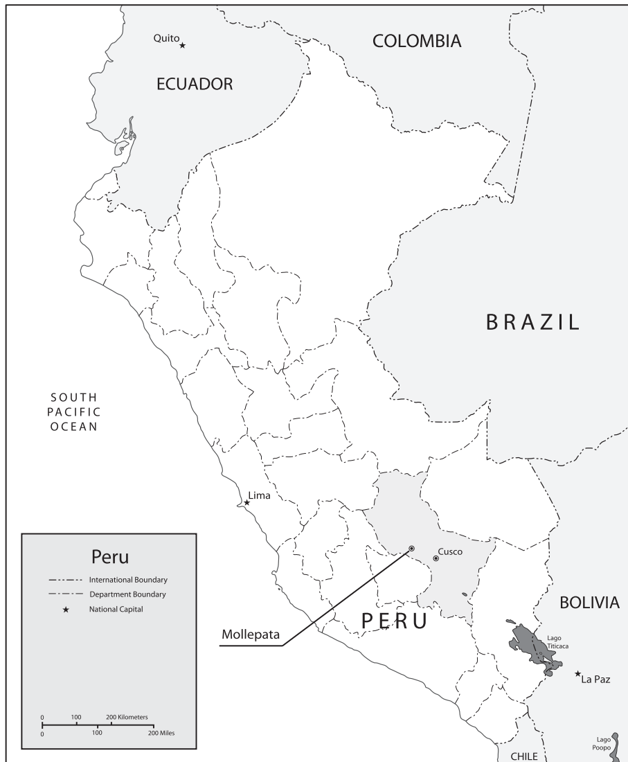
Fig. 1. Map of Mollepata, Cusco, Peru.

Again, several peasant leaders were asked about this perspective, and recognized the validity of such an explanation.