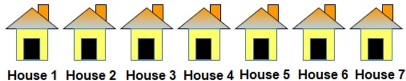
Figure 1 – Simulation with houses

For this part, the student is asked to carry out an activity designed to solve a concrete instance of the linear search problem and, after achieving it, to answer questions aimed at obtaining a precise description of how she/he solves it and why the method is successful. The student is presented with a row of numbered cards on a table and is told that they represent door numbers of houses on a street. The task is to search for a specific person within the row of houses.